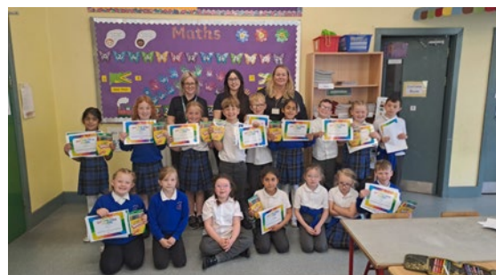
Students of Sacred Heart Granard receiving their prizes.

The Road Safety team called to several national schools in County Longford to present certificates and prizes to students who participated in a Bike Week road safety promotion and entered the Road and Bike Safety Colour Poster Competition.